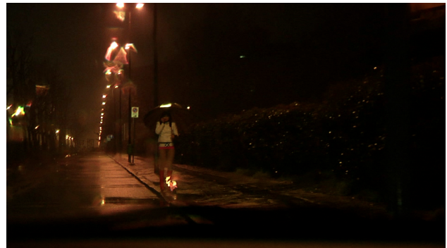
Sexual Exploitation: Stories from Romania, Albania, and Italy.