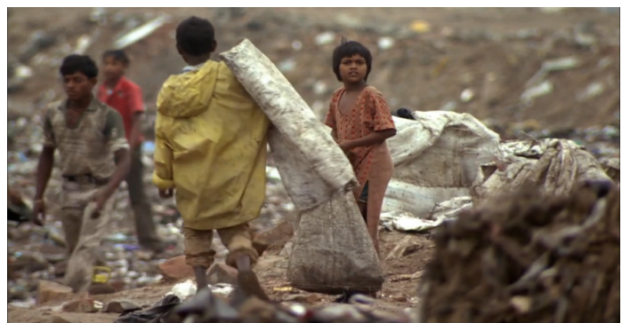
Children working at the Ghazipur Landfill in New Delhi, India