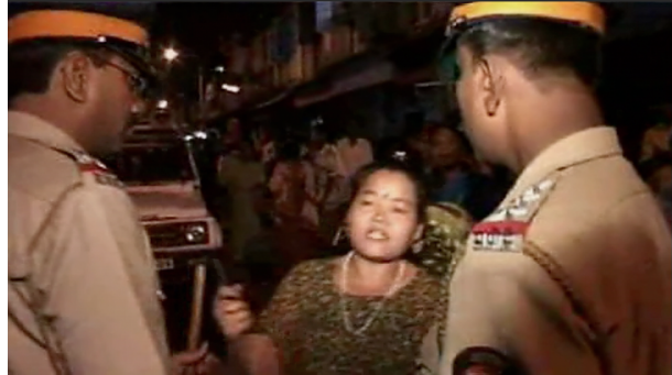
Sexual Exploitation: Brothels of Mumbai, India