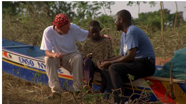
Forced Labor; Fishing boys enslaved on Lake Volta in Ghana